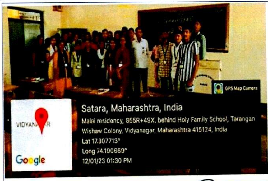
Students participating in speech competition

Speech competition organized by department of Botany on the occasion of birth anniversary of Rajmata Jijau and Swami Vivekanand. 28 participants delivered speech on various subjects.